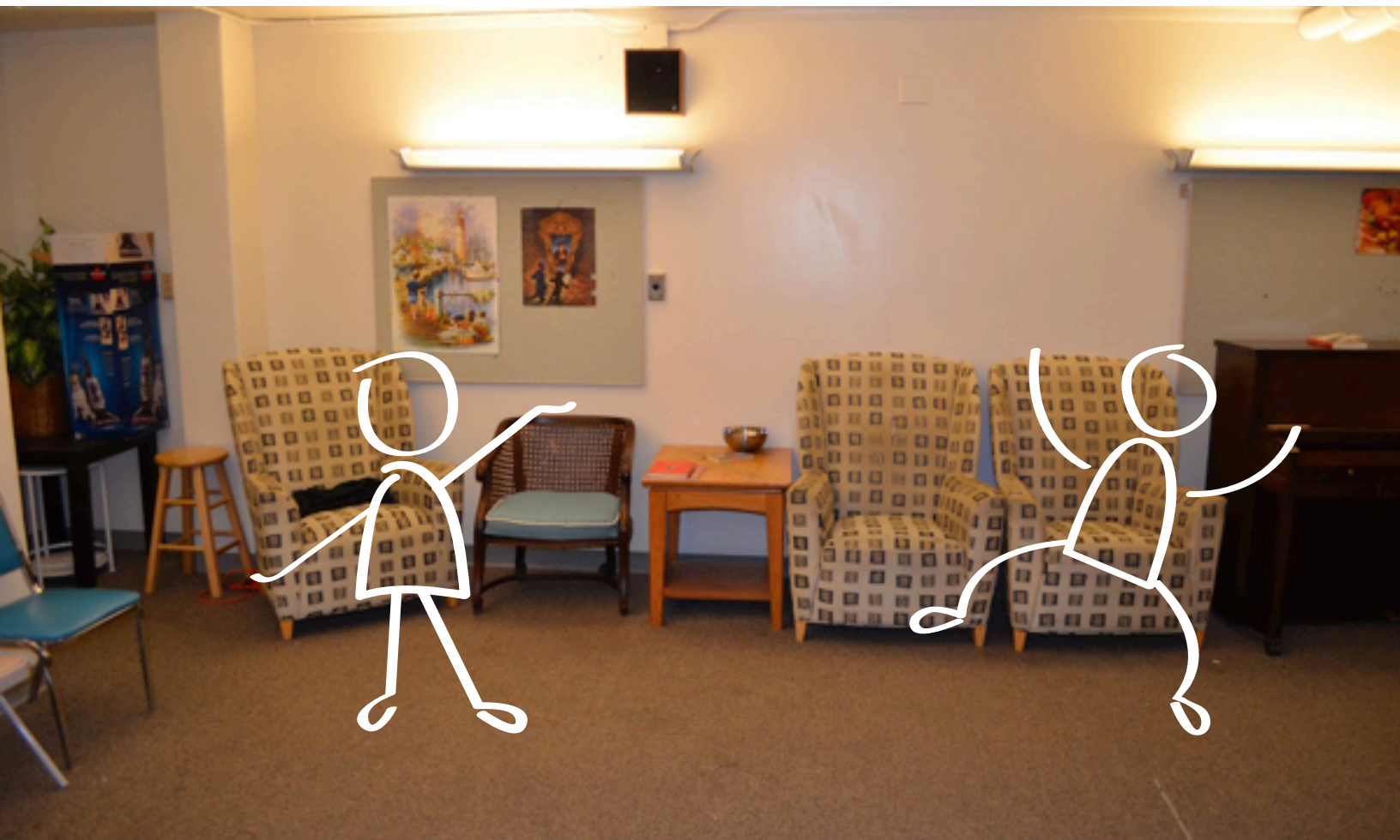
The Fidget Room

2 If I need more space, the usher can help me find the fidget room.